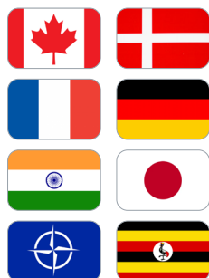
UNCAP Partners and Donors