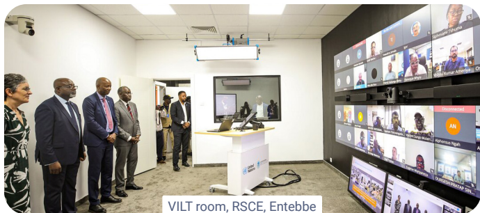
VILT room, RSCE, Entebbe