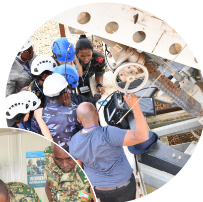
ICT Training of Trainers, 23 Oct-2 Nov 2017, RSCE