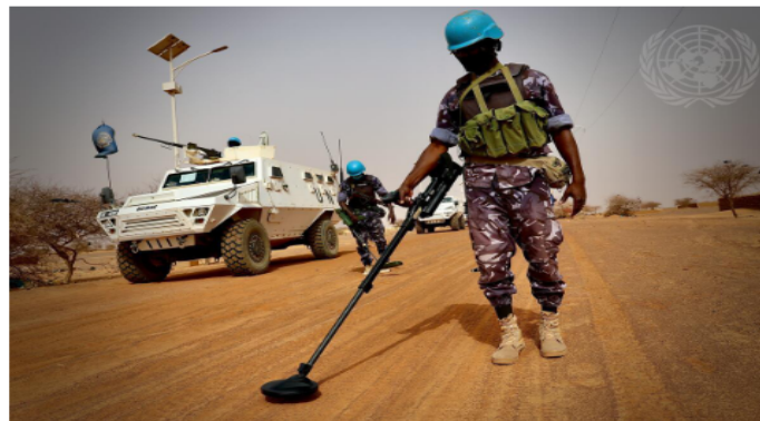
A member of the Search and Detect Team from Togo serving with United Nations Stabilization Mission in Mali (MINUSMA) surveys a road in Menaka in the northeast of Mali.

To ensure full and consistent implementation of General Assembly decisions, the COE Manual contains policies, procedures and actions to be followed by United Nations Headquarters and peacekeeping missions. The COE Manual also provides clarification and explanations, where required, on the implementation of the decisions of the General