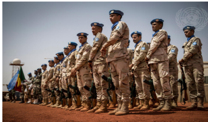
UN Peacekeepers ready to deploy to field missions

The General Assembly did not request the Secretary-General to make a recommendation on the actual rate of reimbursement for the contribution of personnel. However, with a view to assisting the Assembly in making an informed decision on the rate the targeted and interactive approach to be used included: